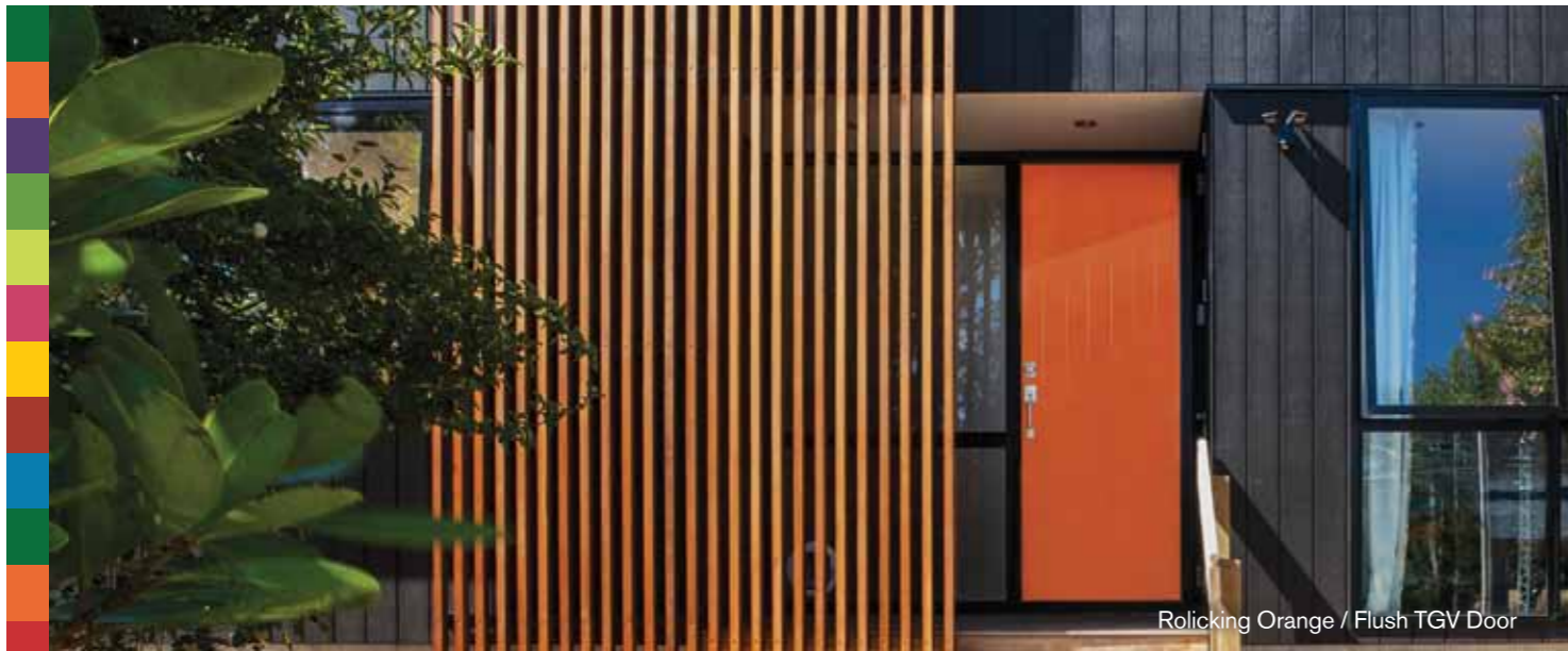
Rolling Orange / Flush TGV Door