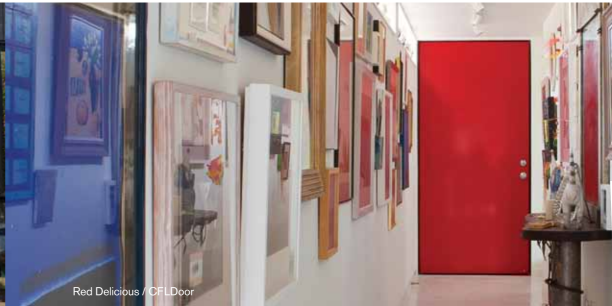
Red Delicious / CFL Door